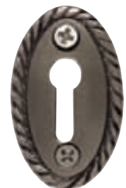
Rope Keyhole Escutcheon 1-7/8" X 1-1/8"