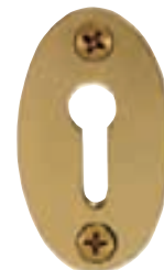
Classic Keyhole Escutcheon 2" X 1-3/16"

These keyhole escutcheons are supplied with our Classic or Rope rosettes when ordered with our mortise locks. Choose either the Classic or Rope style.