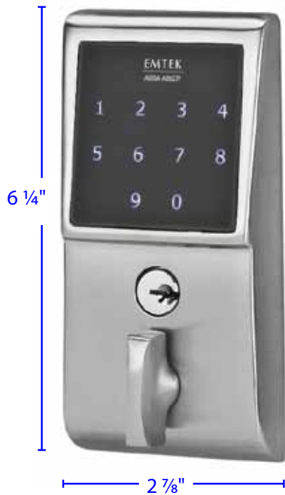
Exterior Projection: 1 1/2"